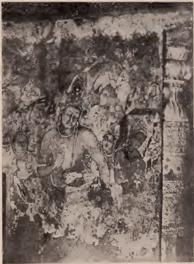
FRESCO IN CAVE 1, AJANTA, PROBABLY ILLUSTRATING "THE GREAT RENUNCIATION" (SEVENTH CENTURY).